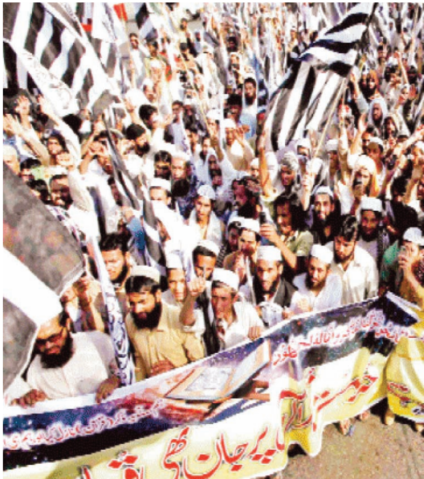
LAHORE: Activists of Jamaat ud-Daawa chant slogans against the US pastor at Faisal Chowk.

Another example of irresponsible reporting is a photo that appeared on March 26, 2011 in The Nation.